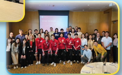
A group shot of SALSA students and CityUHK staff