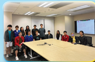
SALSA students and CityUHK staff gather to review the support provided by the school