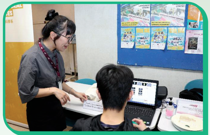
Hands-on experience of a psychological experiment for prospective students