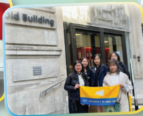
Group photo taken at the London School of Economics and Political Science (LSE)