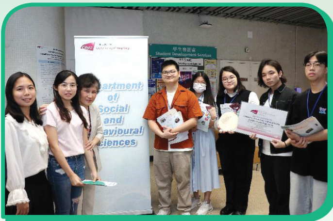
Visitors and current students from various disciplines who helped promote our programmes