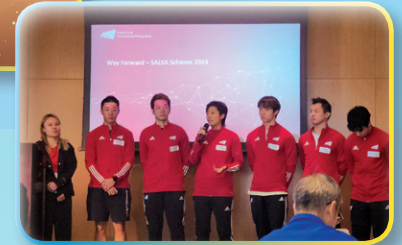
SALSA students sharing their learning experiences at City University of Hong Kong