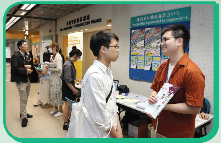
An interaction between a current and a prospective student