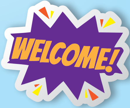
CRSO & CRIMLLB Orientation Day