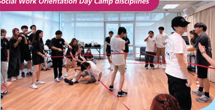
Social Work Orientation Day Camp disciplines

For the Social Work programme, an orientation day camp was held at the Breakthrough Youth Village. During the orientation, students shared their experiences with both current and incoming students, fostering a sense of belonging to the university. This event aimed to provide new students with opportunities to build social connections, encourage engagement in university life, and assist their transition by introducing them to the university's facilities, resources and study tips.