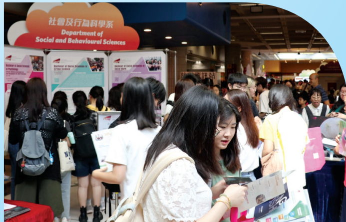
Visiting us at the inquiry counter